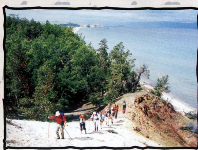
Olkhon trail, part #15